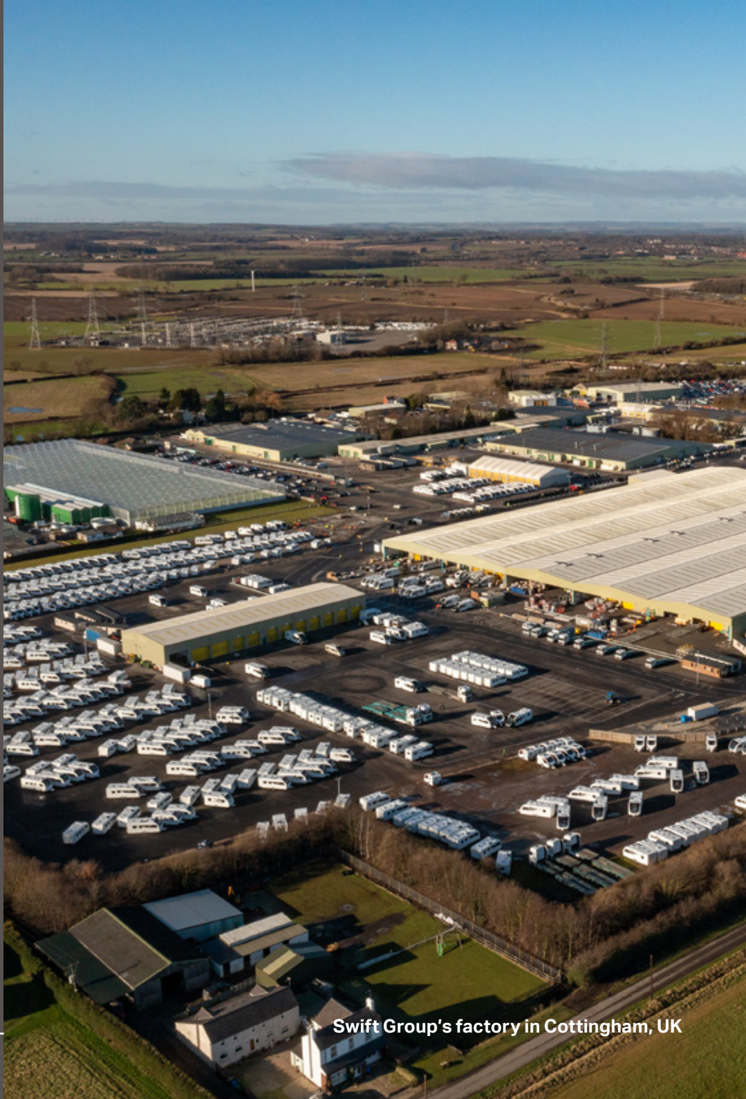
Swift Group's factory in Cottingham, UK