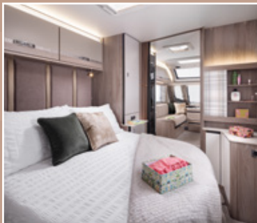
Exclusive Duvalay mattress