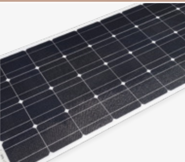
Two 100W solar panels