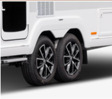
Diamond alloy wheels and pull-out step