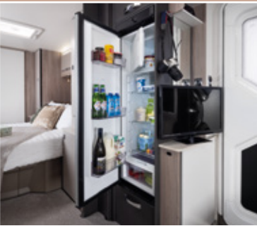
Dometic 133L fridge freezer