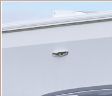
Offside service light