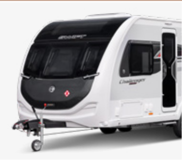
Stylish exterior and high rise chassis